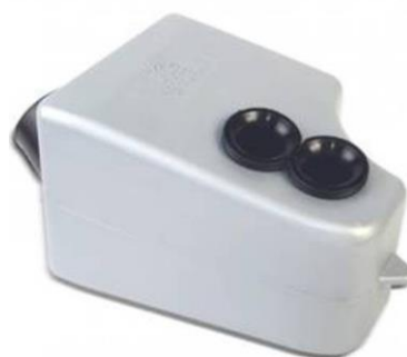
X30 type airbox

Airbox must be 90's era specific. The X30 Style airbox is allowed. (Below pic.)