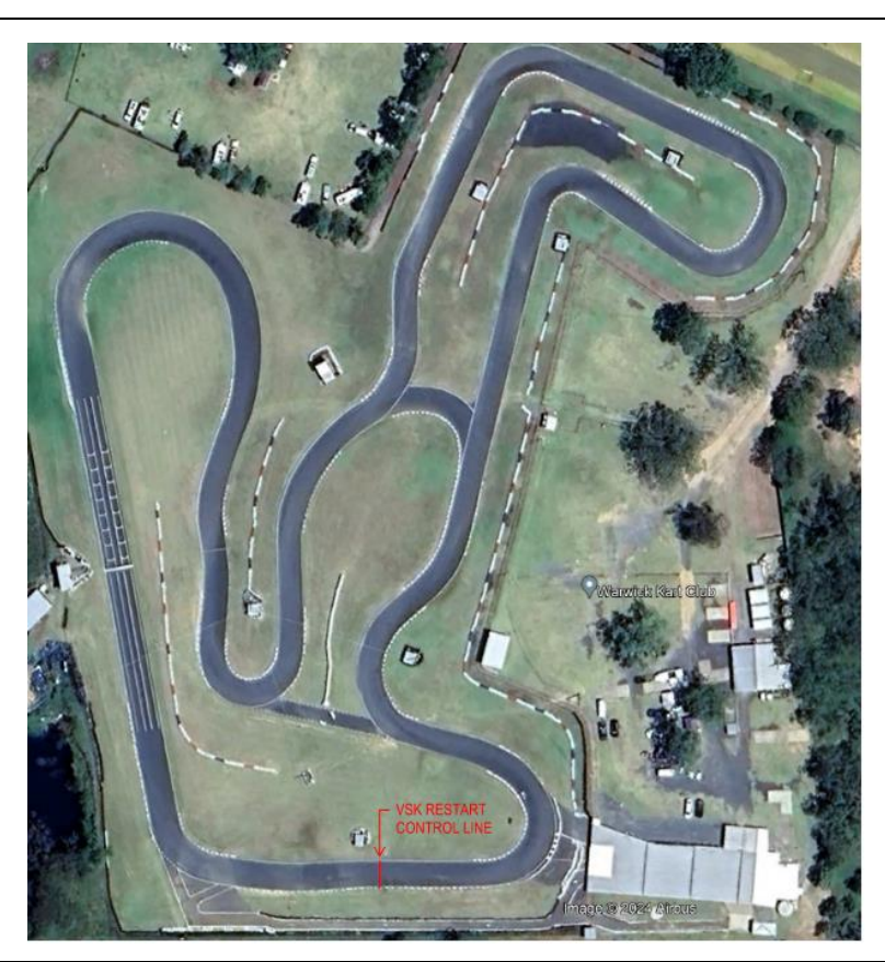
VSK Restart Control Line

Once the 1 lap to go signal is provided from the start line, the lead kart will control the pace of the pack at a constant speed (there must be no speeding and slowing to bunch or spread the field behind) and may resume race pace from any point after the control line, which will be identified during drivers briefing. Once the lead kart resumes race pace, full race pace must be maintained and they must not slow and bunch the field again.